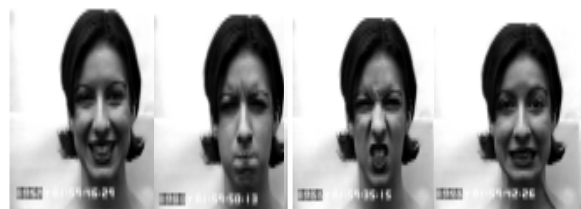
No Pain Severe Chronic Mild

Ekman and Friesen find six universal facial expressions that are expressed and interpreted in the same way by humans of any origin all over the world. Figure shows one example of each facial expression. The Facial Action Coding System (FACS) precisely describes the muscle activity within a human face .So-called Action Units denote the motion of particular facial parts and state the involved facial muscles. Combinations of AUs assemble facial expressions. Extended systems such as the Emotional FACS specify the relation between facial expressions and emotions.